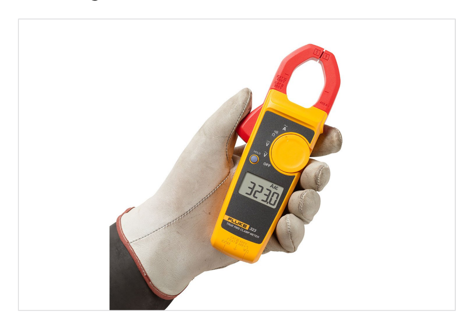
Fluke 323 Fluke 323 True RMS Clamp Meter